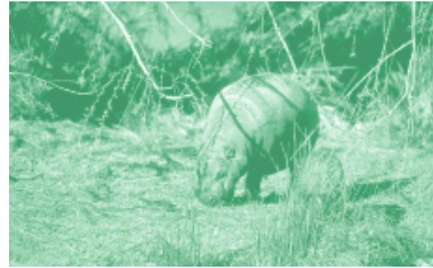
Pygmy hippo, Liberia