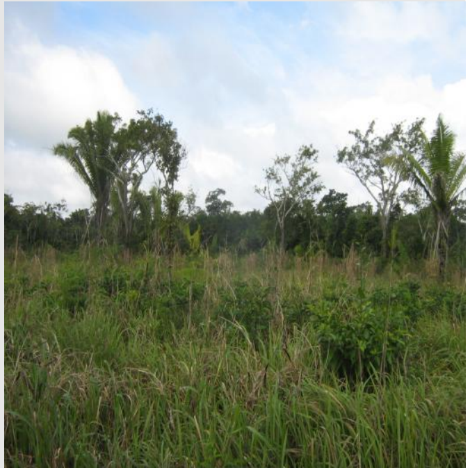
Upper left , Pasture land that has been overtaken by native grasses locally known as pasture grass. Upper right , cleared grassland left behind by the grazing of cows. Lower left , Cohune Palm tree found along the fringes of the cleared land. Lower right , borderline high grass forming part of the secondary transition vegetation cover.