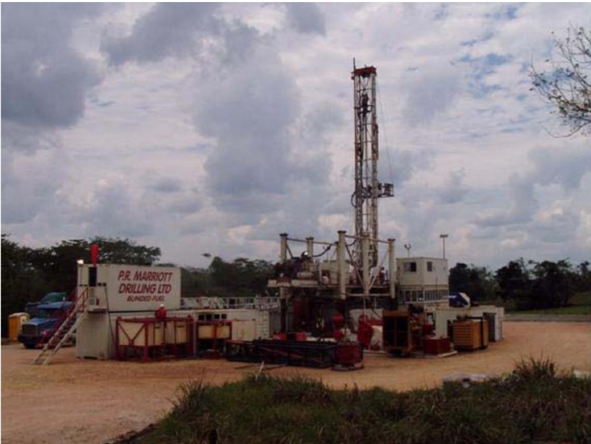
Plate A: P.R. Marriot Drilling Rig