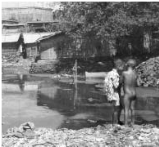
Dhaka, Bangladesh

E-LAW U.S. is working with partners around the globe to help communities protect children from toxic chemicals.