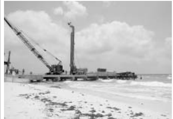
More piers in Cancun mean less habitat.